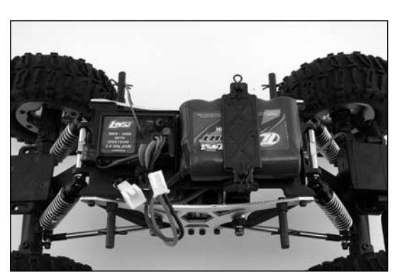
Install the charged battery pack into the chassis as shown (fig.2). Ensure that the battery is laying flat on the chassis.

Remove the transmitter battery cover by sliding the cover from left to right. Install four (4) AA batteries into the battery holder. Pay close attention to the correct direction of the positive (+) and negative (-) ends as marked in the tray. Once all 4 batteries have been installed, reinstall the battery cover by sliding it on from right to left.