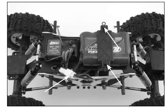
Reinstall the battery strap and body clips. Plug the battery pack into the ESC (fig. 3).