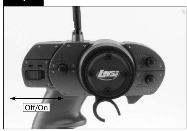
Always turn on the transmitter first by sliding the switch on the left side of the wheel from left to right. The small red and green lights above the switch should both light up. If not, you need to check for low or incorrectly installed batteries.